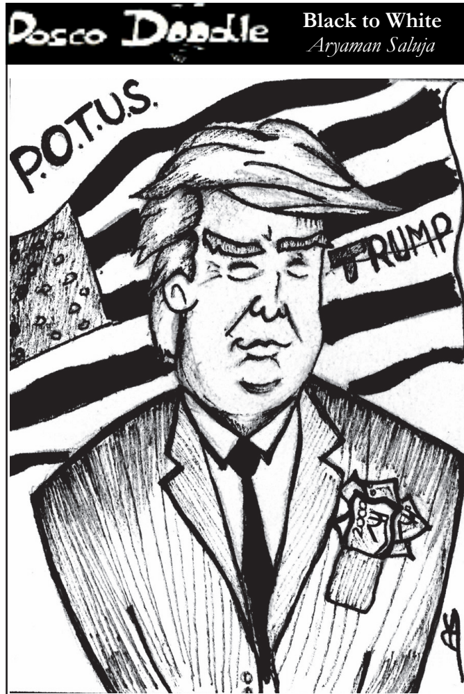
Black to White Aryaman Saluja

Victory belongs to the most persevering.