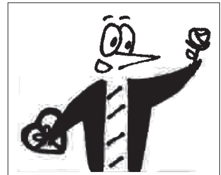
The Weekly wishes the School Community a Happy Valentine's Day!