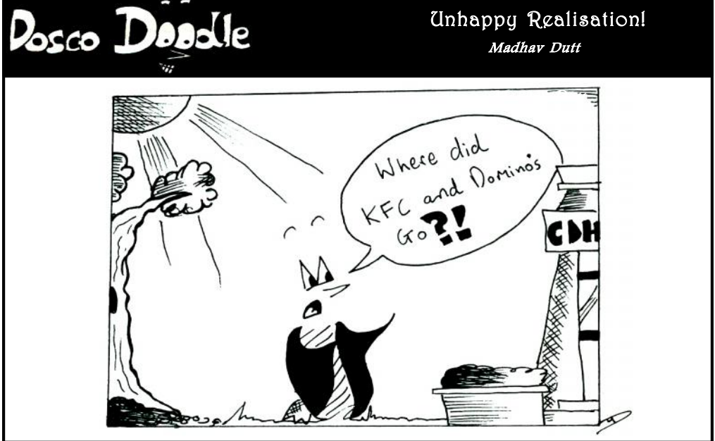
3. The Doon School Weekly Saturday, October 27