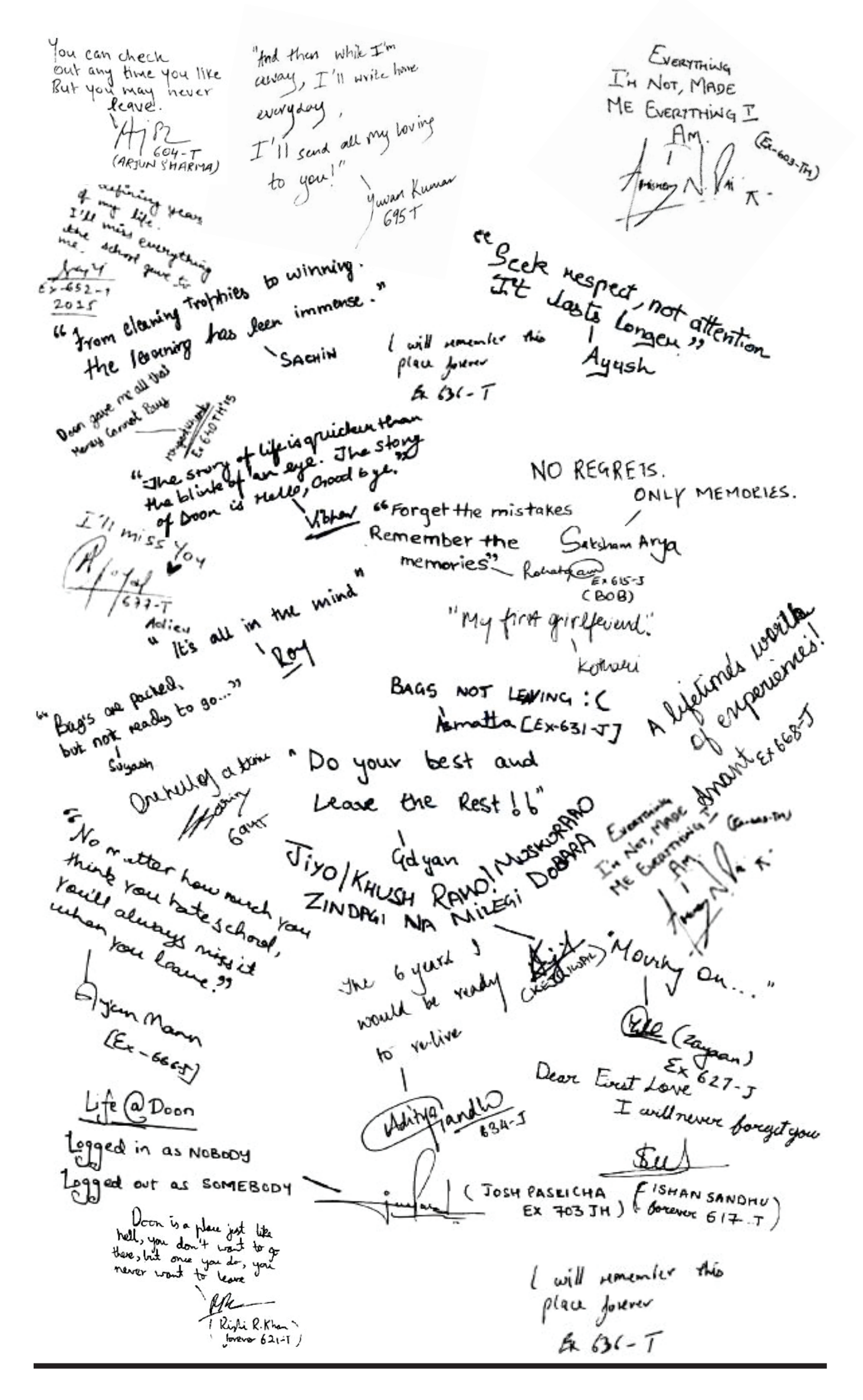
6. The Doon School Weekly Saturday, March 7