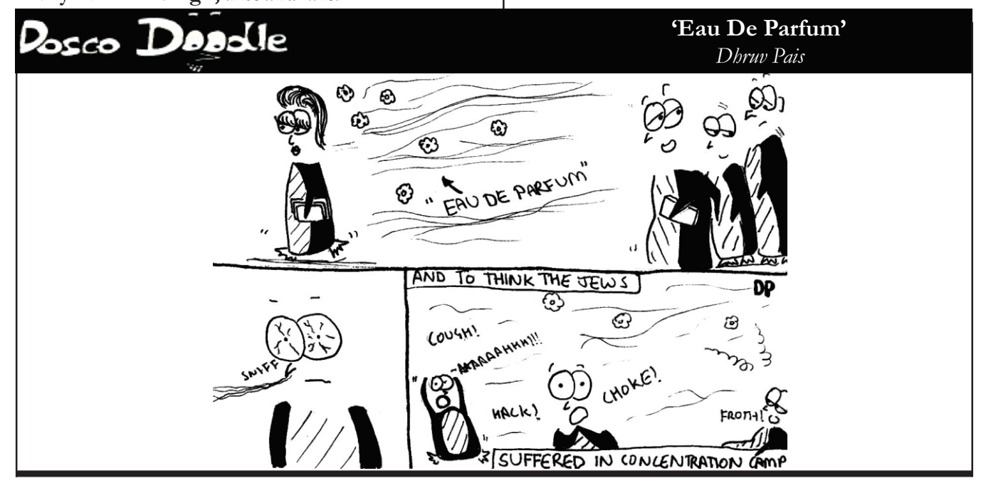
2. The Doon School Weekly Saturday, October 31