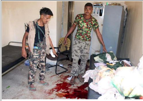
Yemeni pro-government fighters, loyal to exiled Yemeni President Abedrabbo Mansour Hadi, inspect an elderly care home in Aden after it was attacked by gunmen.

Yemen, where the interna-tionally-recognised government is grappling with an Iran-backed rebellion on one side and a growing jihadist presence on the