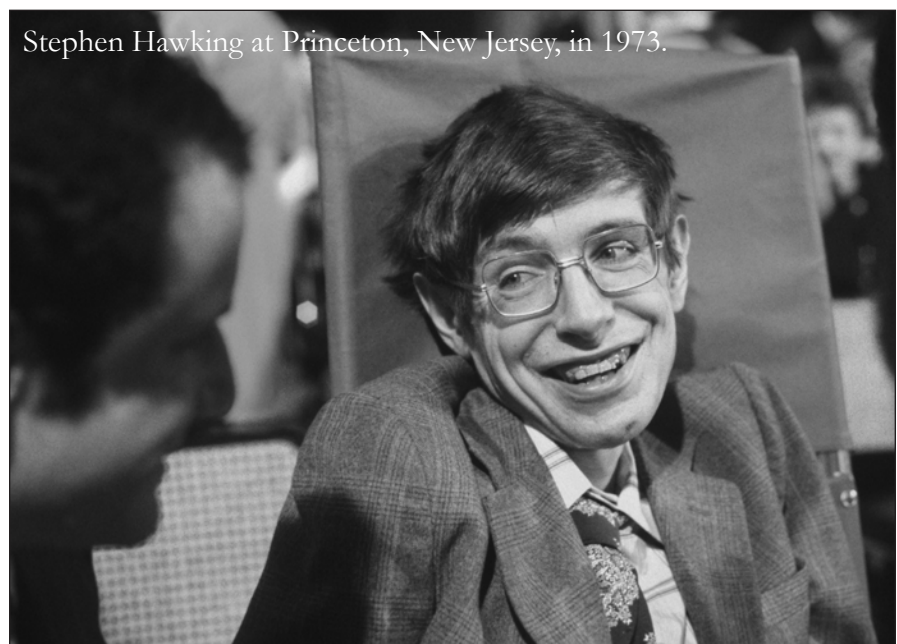
Stephen Hawking at Princeton, New Jersey, in 1973.

His death is undeniably a huge loss to the field of physics as well as to humanity in general. His understanding of physics made up for his inability to move and his intellect won him his success. His loss was not only sudden, but had evidently affected many who only connected with him through his books. It all seems like too much of a coincidence that he was born on the same date as Galileo’s death, lived 53 years more than he was expected to, achieved all that he did, and died on the day of Einstein’s birthday, but it is his intellectual achievements that makes his life truly remarkable. “It is true that our experiences shape us, but we could choose the ones we want to be shaped by”. Stephen Hawking lived to prove it.